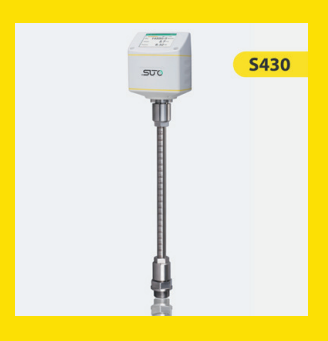
S430 Flow Meter for wet compressed air (insertion type)