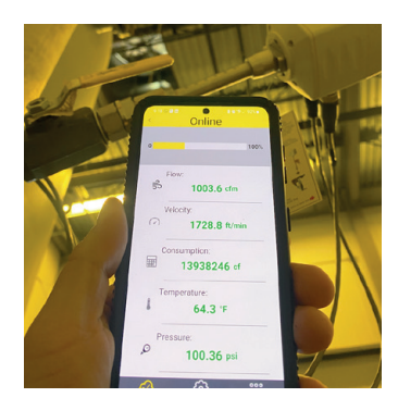
Real-time data trough the SUTO Flow Meter App S4C-FS, despite the difficult to reach installation location of the sensor.