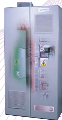
Original or Retrofit VSD