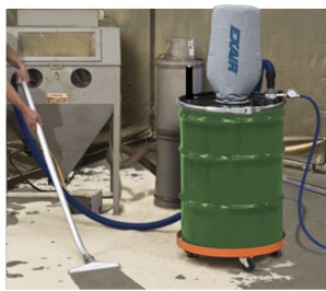
Sand that covers the floor around a sand blaster is quickly vacuumed into the drum using the rugged foot tool.