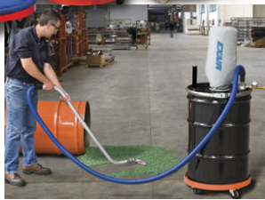
The Heavy Duty Dry Vac cleans up a spill of tumbling media.