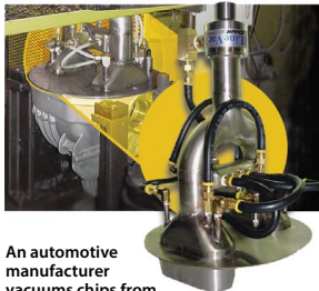
An automotive manufacturer vacuums chips from drive train differentials with a Model 150200 2" (51mm) Heavy Duty Line Vac.