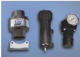
Heavy Duty Line Vac Kits include a Heavy Duty Line Vac, mounting bracket, filter separator and pressure regulator (with coupler).

If you have special requirements, please contact an Application Engineer to discuss the application.