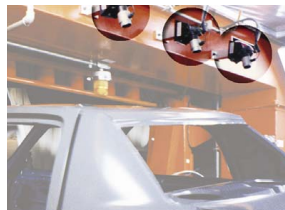
(3) Gen4 Ion Air Cannons blow contaminants from car bodies prior to painting.