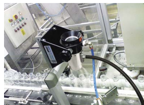
The Model 8292 Gen4 Ion Air Cannon System eliminates the static and dust prior to filling the bottles.

EXAIR's EFC (shown on page 7) is an electronic flow control for compressed air. For production lines, it can sense when no part is present and will automatically turn off the compressed air to the Gen4 Ion Air Cannon until the next part moves into position.