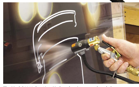
The Model 8293 Gen4 Ion Air Gun cleaning artwork and glass prior to framing.

The Gen4 Ion Air Gun is quiet, lightweight and features a hanger hook for easy storage. The 10 foot (3m) armored and electromagnetic shielded power cable is extremely flexible, designed for rugged industrial use.