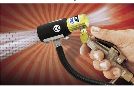
80% of the delivered air is induced, minimizing air consumption of the Gen4 Ion Air Gun.

Maximum Ambient Temperature: 165°F (74°C) Compressed Air: 1/4 NPT inlet provided.