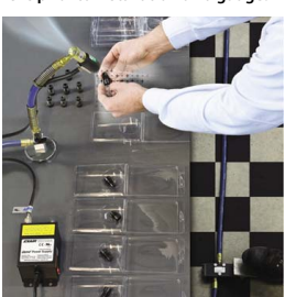
The Gen4 Model 8910 Instant Static Elimination Station removes contaminants on plastic fittings prior to packaging.