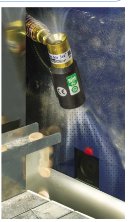
The Model 8294 Gen4 Ion Air Jet with Gen4 Power Supply neutralizes static and removes dust from a counting sensor window on a tablet production machine.