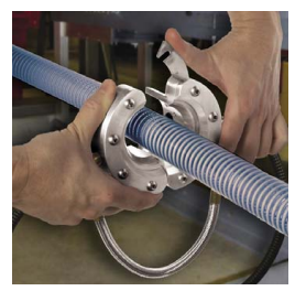
The split design unlatches easily to fit around the moving part - no threading required.