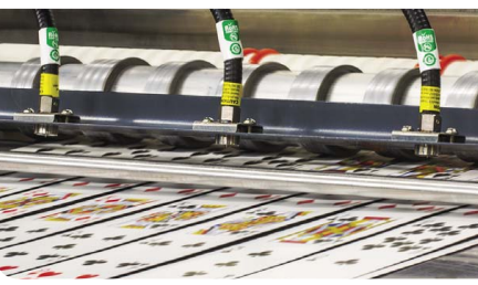
Gen4 Ionizing Points remove static from a card slitting operation.