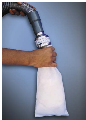
The low cost Model 130200 2" (51mm) Light Duty Line Vac conveys fibers to fill pillows, stuffed animals, diapers, etc.

The Light Duty Line Vac features inlet and outlet diameters common to hose and tube sizes. Eight sizes for diameters from 3/4" to 6" (19 to 152mm) are available. Standard construction is aluminum. (For corrosion resistant stainless steel models that are suitable for high temperature and food service, please see Line Vac models on page 146.) No moving parts or electricity assures maintenance free operation. (If higher conveying rates or mounting brackets are desired, see the Line Vac models on page 146.)