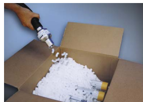
A Model 130125 1-1/4" (32mm) Light Duty Line Vac can fill or empty the packing peanuts from shipping cartons.

The Light Duty Line Vac features inlet and outlet diameters common to hose and tube sizes. Eight sizes for diameters from 3/4" to 6" (19 to 152mm) are available. Standard construction is aluminum. (For corrosion resistant stainless steel models that are suitable for high temperature and food service, please see Line Vac models on page 146.) No moving parts or electricity assures maintenance free operation. (If higher conveying rates or mounting brackets are desired, see the Line Vac models on page 146.)