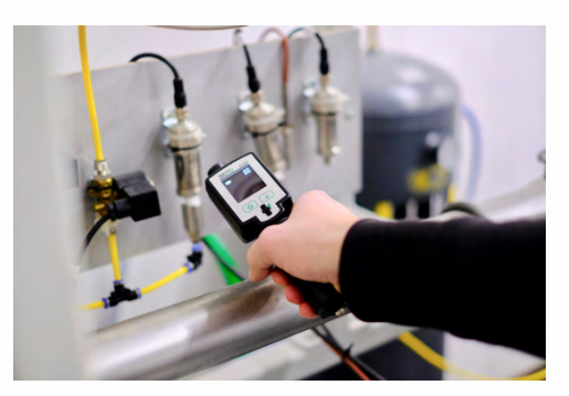
Ultrasonic Leak Detector S 530

Calculation example at 0.6 MPa: 1 hole of 1mm diameter = 270 EUR/year