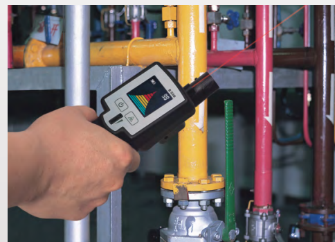
Leak detection from distance with the integrated laser pointer