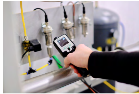
Ultrasonic Leak Detector S 530