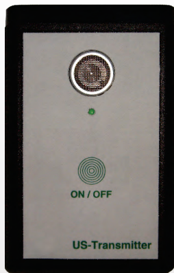
Ultrasonic tone generator