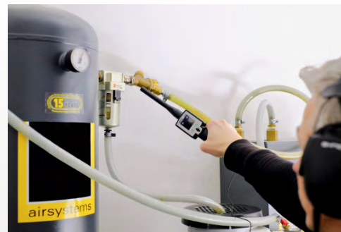
Leak detection with focus tube