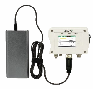
S461 powered by power bank with connection cable.

Note: power bank must be sourced locally due to shipping restrictions [USB-C, 20 V, min. 100 mA]