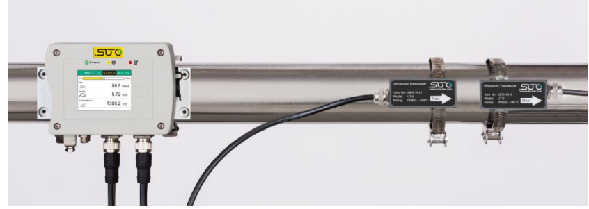
S461 and transducers mounted on pipe