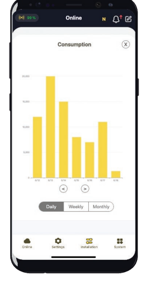
Instant view of daily, weekly and monthly consumption through mobile app.

The S461 comes also as portable version in a transport case.