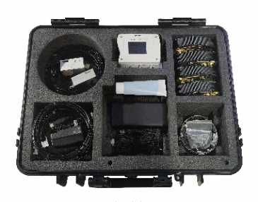
Transport casing holding up to 2 transducer pairs, T-Sensors, belt and metal stretchers, power bank, cables, charger and documentation