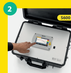
S600 Portable Compressed Air Purity Analyzer for On-site Spot Checks and Audits