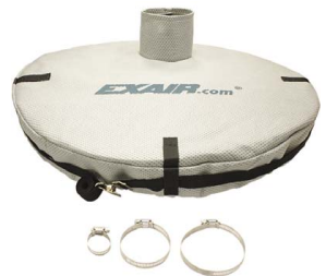
Line Vac Drum Cover

EXAIR's fine mesh non-woven Drum Cover is built to fit over the top of 55 or 30 gallon drums. The breathable material allows the air from a Line Vac air operated conveyor to circulate, whether moving material in or out of the drum. The cover prevents contamination of your material and keeps material from escaping the drum which keeps your work environment cleaner and safer. Since it is fabricated to fit 55 or 30 gallon drums, it is the simplest of solutions when needing a containment vessel for your transferred scrap, trim, waste, parts, chips or pellets. It is suitable for Line Vac conveyance hoses from 3/4" through 3.4" outside diameters and comes complete with hose clamps and a durable spring buckle strap for quick and easy installation.