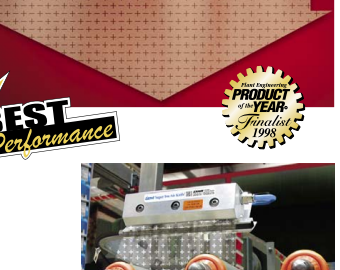
The Gen4 Super Ion Air Knife eliminates the static charge on labels being applied to PET soft drink bottles.