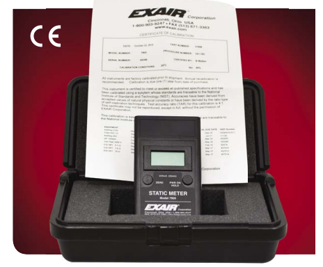
The Model 7905 Digital Static Meter comes complete with a hard-shell plastic case and a 9 volt battery. Certification of the accuracy and calibration traceable to NIST (National Institute of Standards and Technology) is also included. Calibration is available.

The Digital Static Meter features a push button "hold" for readings, a low battery indicator and an automatic "power off". A "zero" button to zero the instrument ensures an accuracy of ±5% of the reading when it is one inch (25mm) from the charged surface.