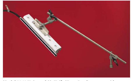
Model 9060 Universal Air Knife Mounting System provides secure, precise positioning for the Gen4 Super Ion Air Knife. See page 27 for details.

Shims: Thicker shims can be installed easily if additional hard-hitting velocity is required. For more information, see "shim sets" on page 23.