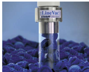
A special Threaded Line Vac has a smooth diameter for hose on the intake and threads on the exhaust that attach to PVC pipe.