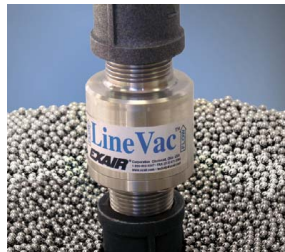
A drawer slide manufacturer conveys ball bearings with the Model 141125 1-1/4 NPT Stainless Steel Threaded Line Vac to an assembly station.

Threaded Line Vac conveyors are ideal for conveying large volumes of material over long distances. They eject a small amount of compressed air to produce a vacuum on one end with high output flows on the other. Response is instantaneous. Regulating the compressed air pressure provides infinite control of the conveying rate. Models from 3/8 NPT to 3 NPT are available in aluminum and stainless steel, which are suited to a wide variety of conveying applications. An optional mounting bracket permits easy mounting. No moving parts or electricity assures maintenance free operation.