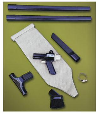
Model 6192 Collection System includes Vac-u-Gun, reusable bag, brush, crevice tool, skimmer tool and (2) extension wands.