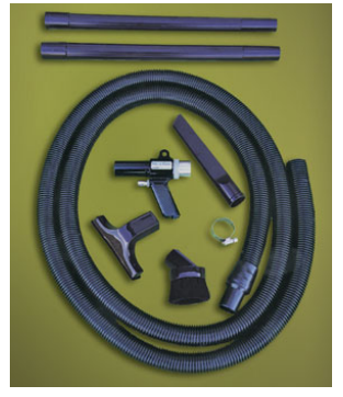
Model 6292 Transfer System includes Vac-u-Gun, 10' (3m) vacuum hose, brush, crevice tool, skimmer tool and (2) extension wands.