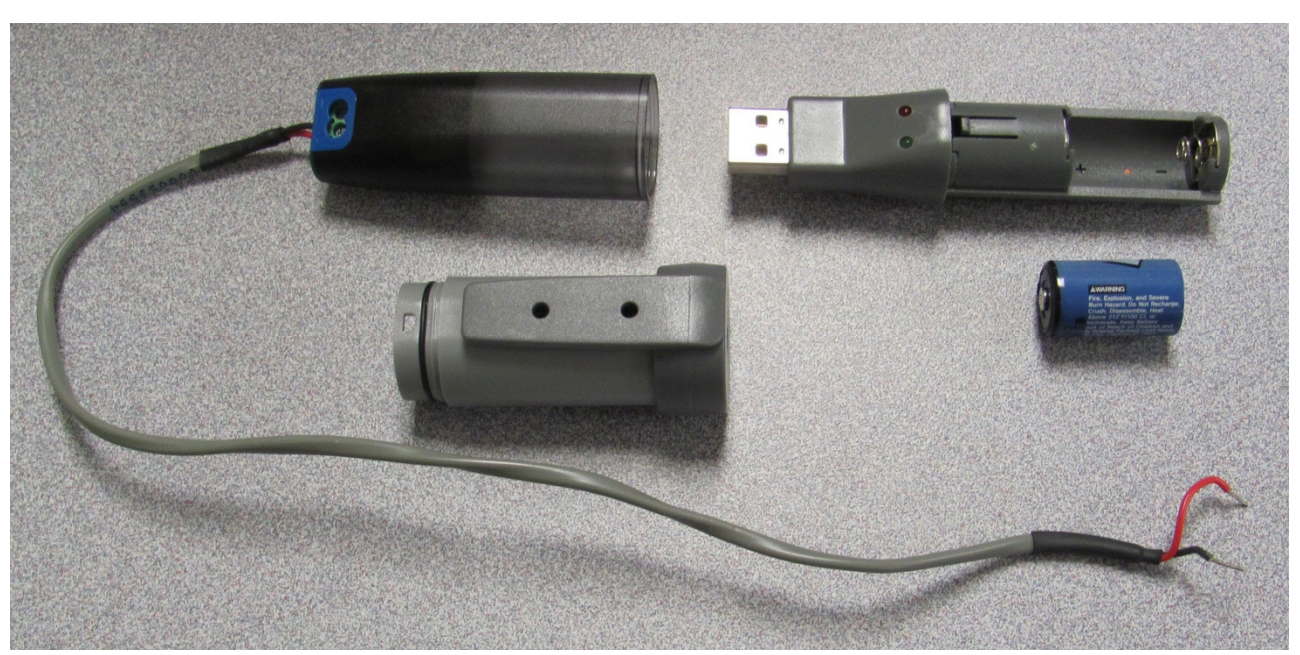
Part 1 – Removing the data logger from the data logging harness and inserting the battery.